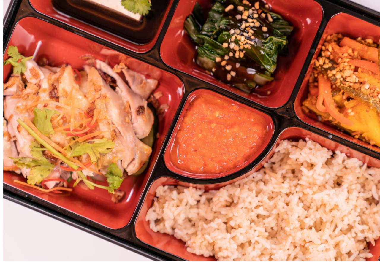
Asian Bento Box