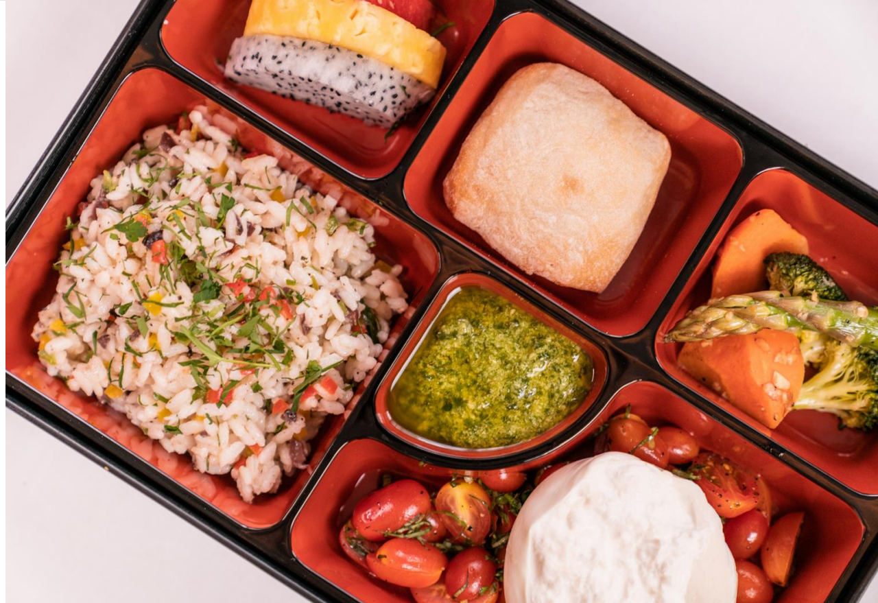
Burrata Bento Box