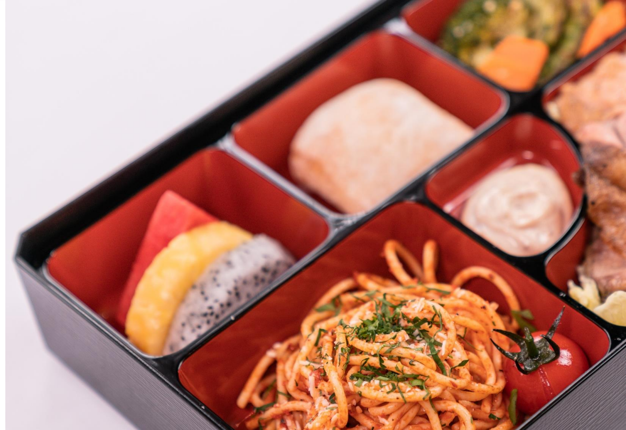
Chicken Bento Box