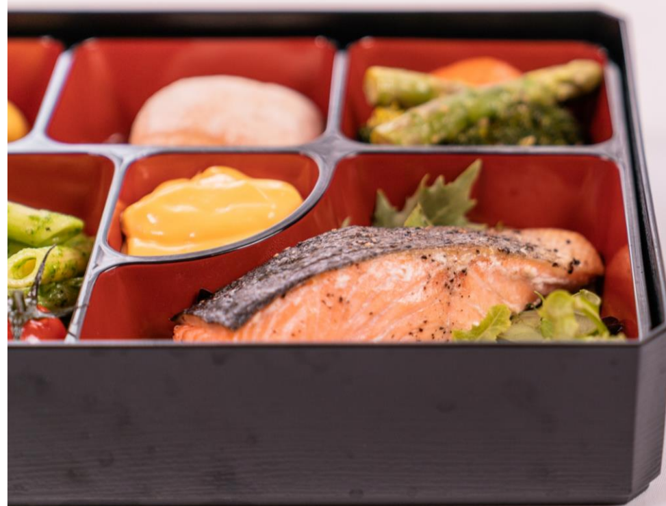
Salmon Bento Box