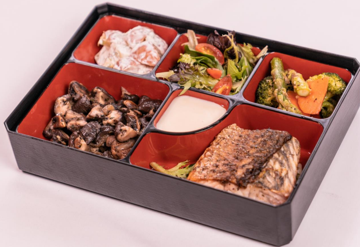
Sea Bass Bento Box